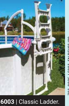
701-0036 / 5001_EN REV01/20 AVAILABLE: US | INT